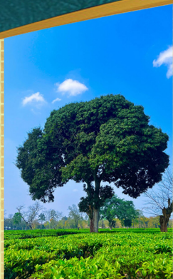
Saptami Phukan PG 2nd Semester