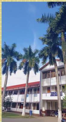
Aines Hussain UG 2nd Semester