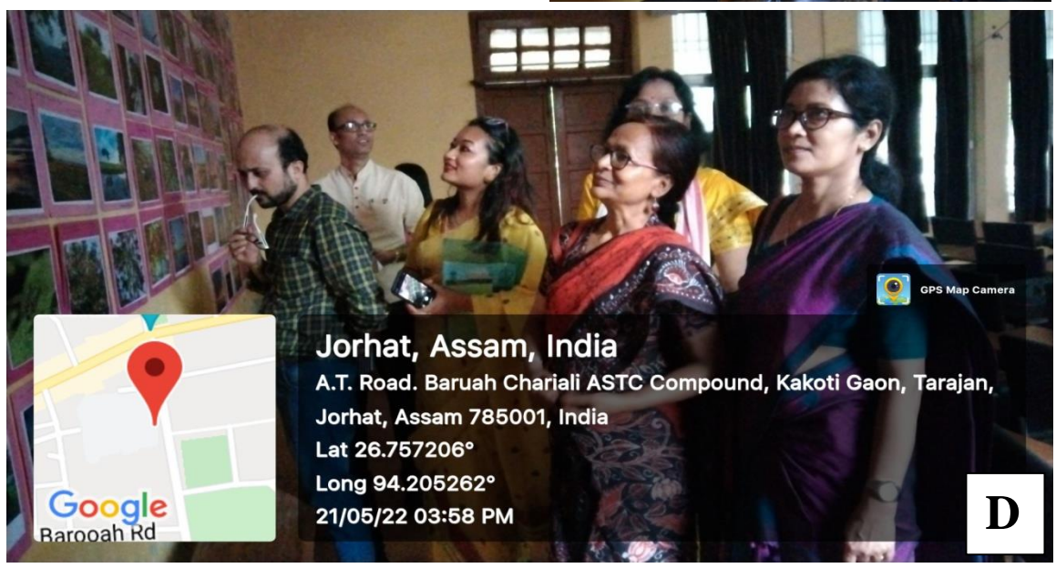
Pic Plate 3: A- Team of street play who acted on use of plastic; B-Poster competition; C- Photography Competition; D- Viewer's of the competition.