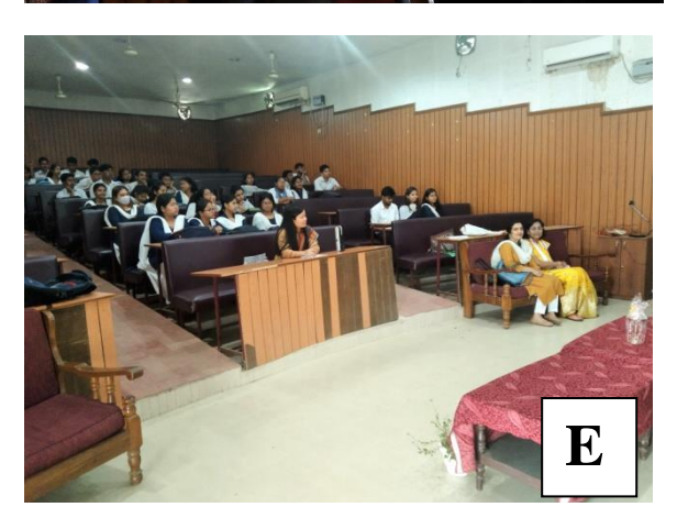
Pic Plate 2: A- Group photo of the talk programme on "Orchid diversity of N.E. India"; B,C- Lecture by Invited speaker; D,E- Part of the audience of the talk programme