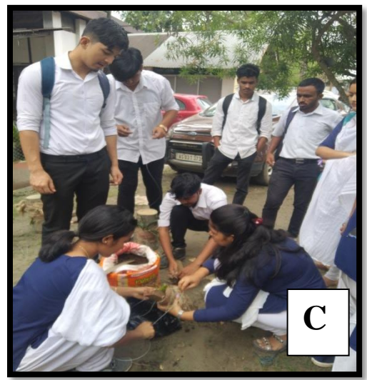
Pic Plate 1(A-C): Orchid plantation programme in the college campus