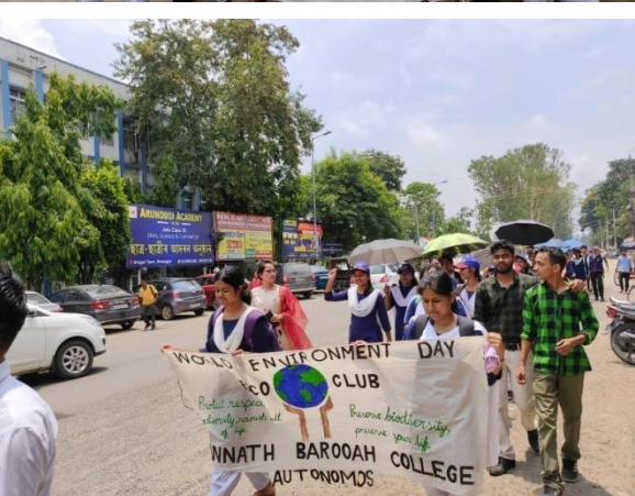
Plate 2: Rally and slogan competition from College to District science centre and Planetarium.