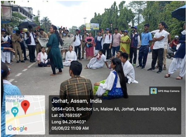
Plate 3: A glimpse of street play