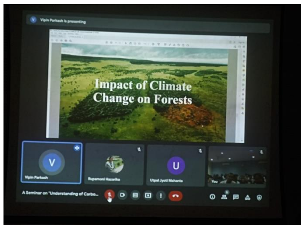
Plate 4: A glimpse of the seminar in blended mode (both online and offline