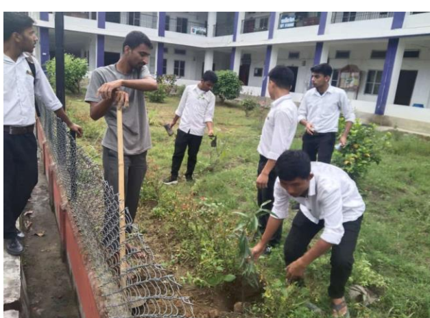
Plate 1: Plantation programme in the main campus and commerce campus of the College